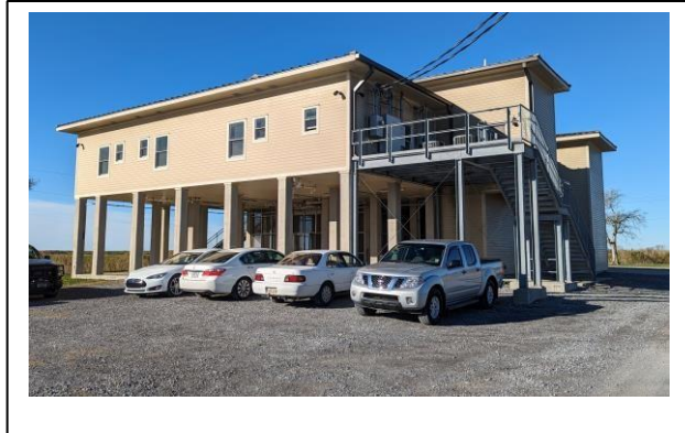
Dorm facility at Rockefeller Refuge